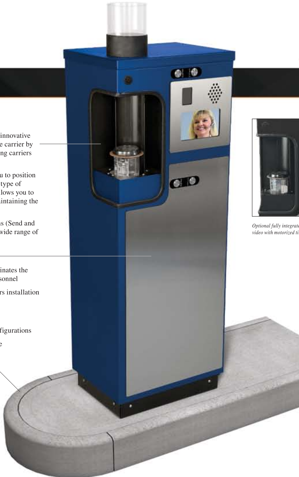
Optional fully integrated video with motorized tube