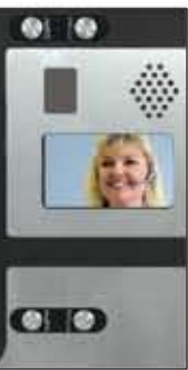
ed one- or two-way color t control on lane camera.