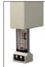
Upsend Two-Sided Manual (Rear View)