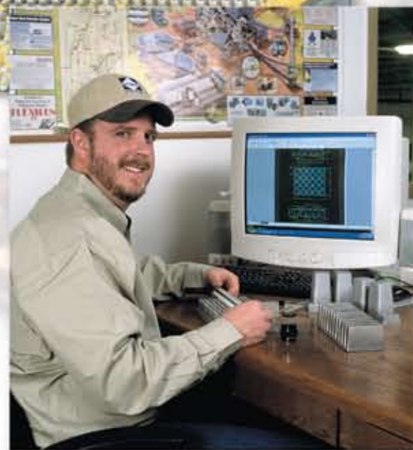
Our in-house tooling facility and engineering department offer more options than anyone else. We can custom design and produce any hole pattern in any quantity, any material, anytime.