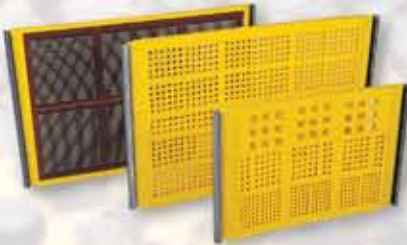
Hook Type Tension Panels