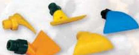
Polyurethane Spray Nozzles