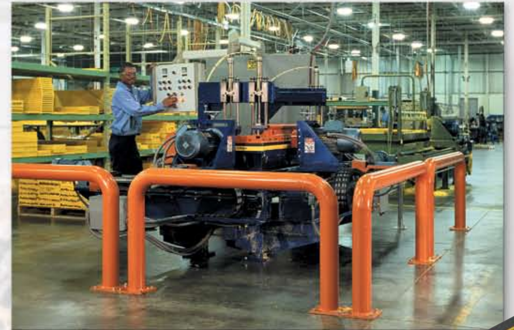
Our precise two-headed milling machine guarantees every screen will install quickly and tightly, thereby optimizing performance to ensure long life and limit downtime.