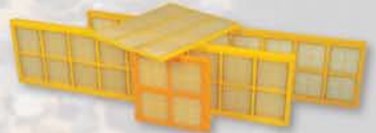
Injection-Molded Segment Panels