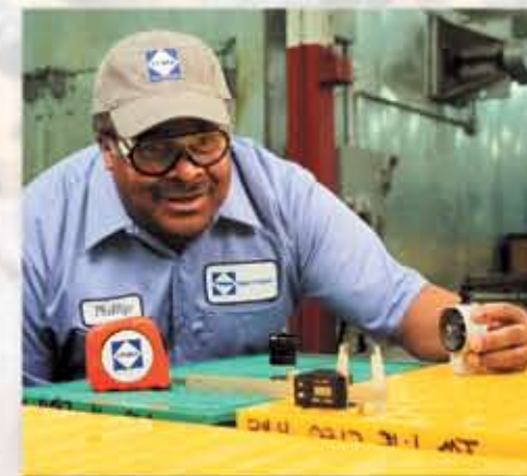
Delivering the best screen for your application is our only goal at TEMA Isenmann. We check aperture, base height and material on every screen. Using durometers, our quality control technicians also ensure proper screen hardness before your panels leave the plant.