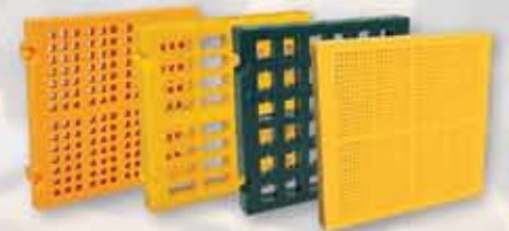
Kombideck,™ Open Cast, Multotec,™ and WS85™ 1' x 1' Systems