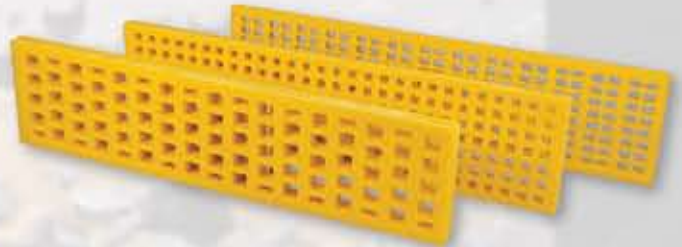
WS85™ Modular System